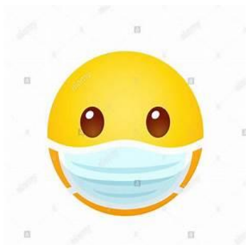
Wear your masks