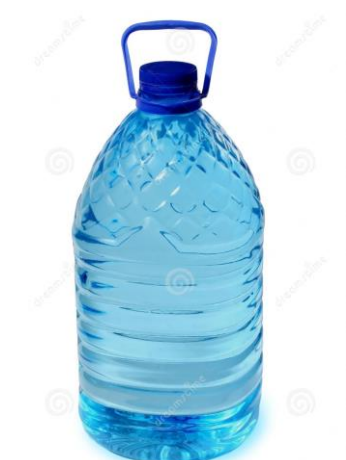
Drink Plenty of Water